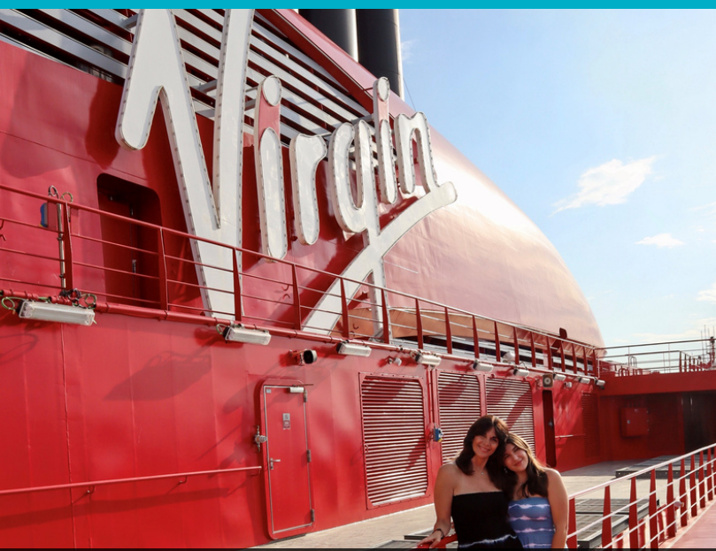
Virgin Voyages Resilient Lady